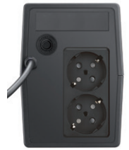
Liebert® iTON 400 VA Liebert iTON 600 VA Liebert iTON 800 VA