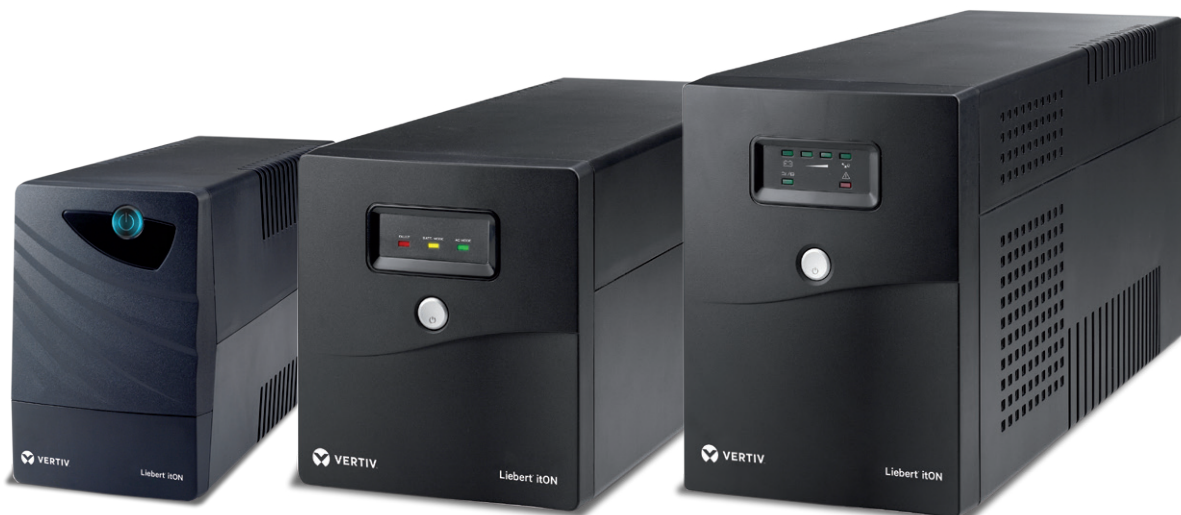
Liebert iTON 600 VA