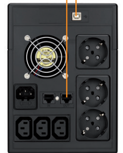
Liebert iTON 1500 VA Liebert iTON 2000 VA

Note: External battery cabinets are not permitted. Internal batteries only.